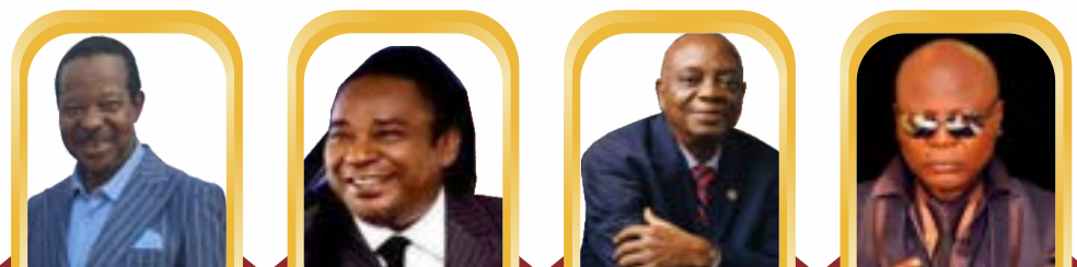
King Sunny Ade