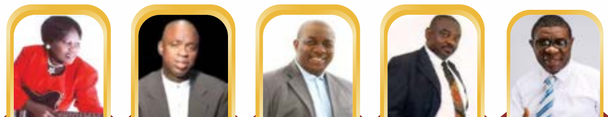
Princess Mojisola Fayemi